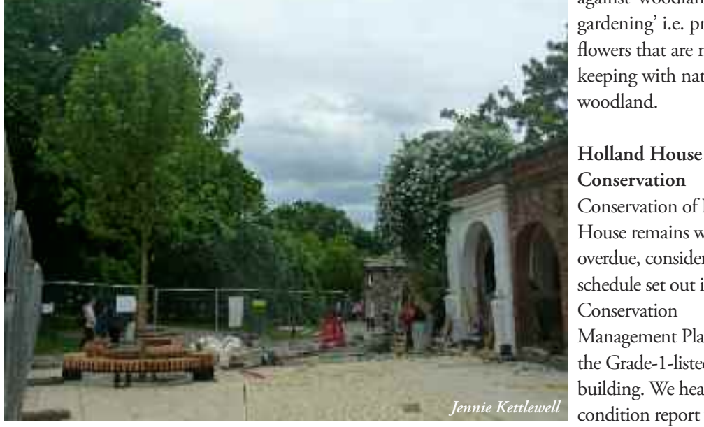
The Café Yard with its new tree