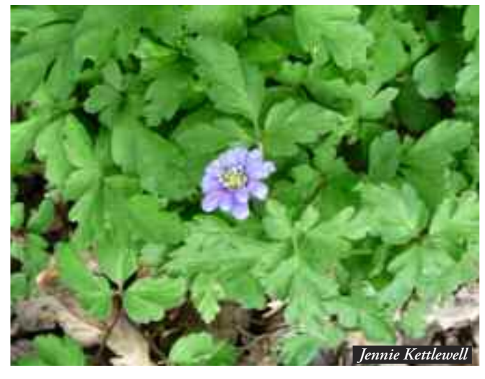
Anemone blanda, taken in March 2011 above the Sun Trap lawn