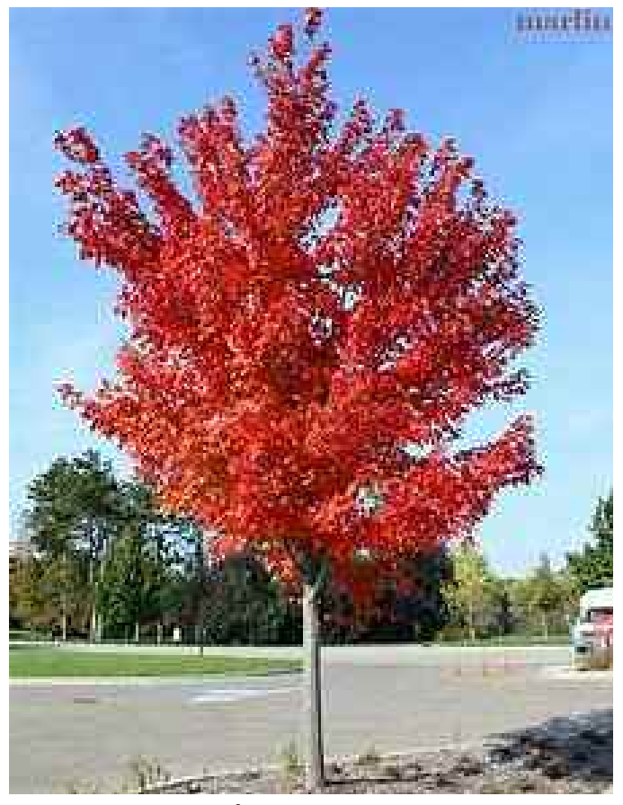
Acer freemanii in autumn

This playground is well used and popular, with the result that it is suffering from the wear and tear of many years. Plans for a much improved playground, including drainage works, have been agreed under a Certificate of Lawful Development, which did not require consultation. Planning consent was, however, required for the equipment over four metres in height, and a decision is due by 26