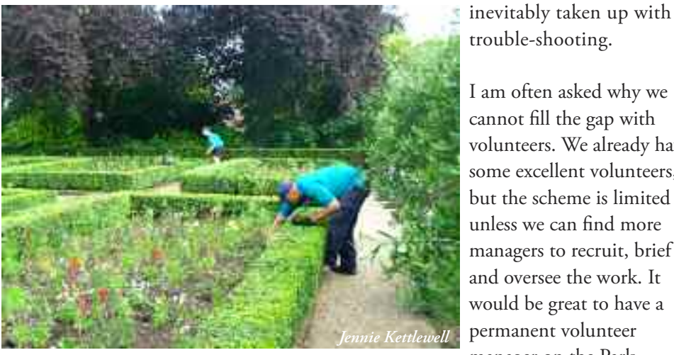
Bedding plants in the Dutch Garden

Anyone paying attention to the media will be well aware that public parks are threatened in many ways, not least by budget cuts. Holland Park is no exception and while, on the whole, significant reductions in the annual operating budget have been staved off over the past couple of years, we do not think this position will last for ever. Cuts will inevitably impact negatively on the park.