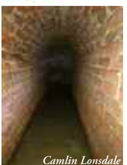
Old sewer under the House terrace

The elegant brick-lined passage pictured left is an old private sewer for Holland House, found under the terrace during the recent landscaping work. Xanthe Quayle of Camlin Lonsdale, the landscape architects who designed the scheme, gave us a fascinating glimpse of the unexpected discoveries during the work on the terrace: hollow chambers, dressed kerbstones, crazy