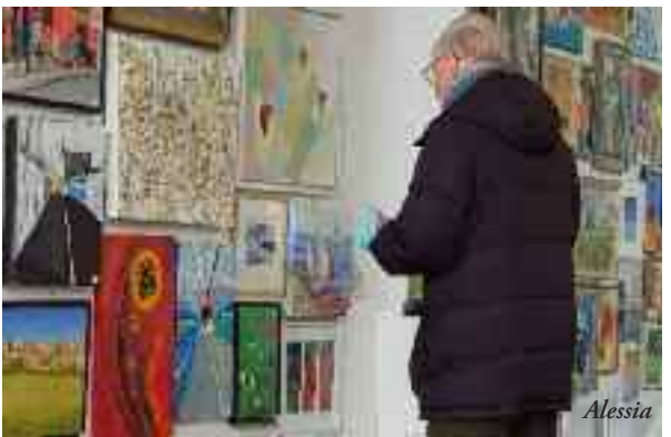
A closer look

of Holland Park and the history of Holland House for many years, being the final owners before handing it over to the Council. Their new development of Holland Green, next to the Design Museum, is breathing new life into this end of the High Street. I would like to thank Ilchester Estates for their support, which I hope will continue and grow in the years