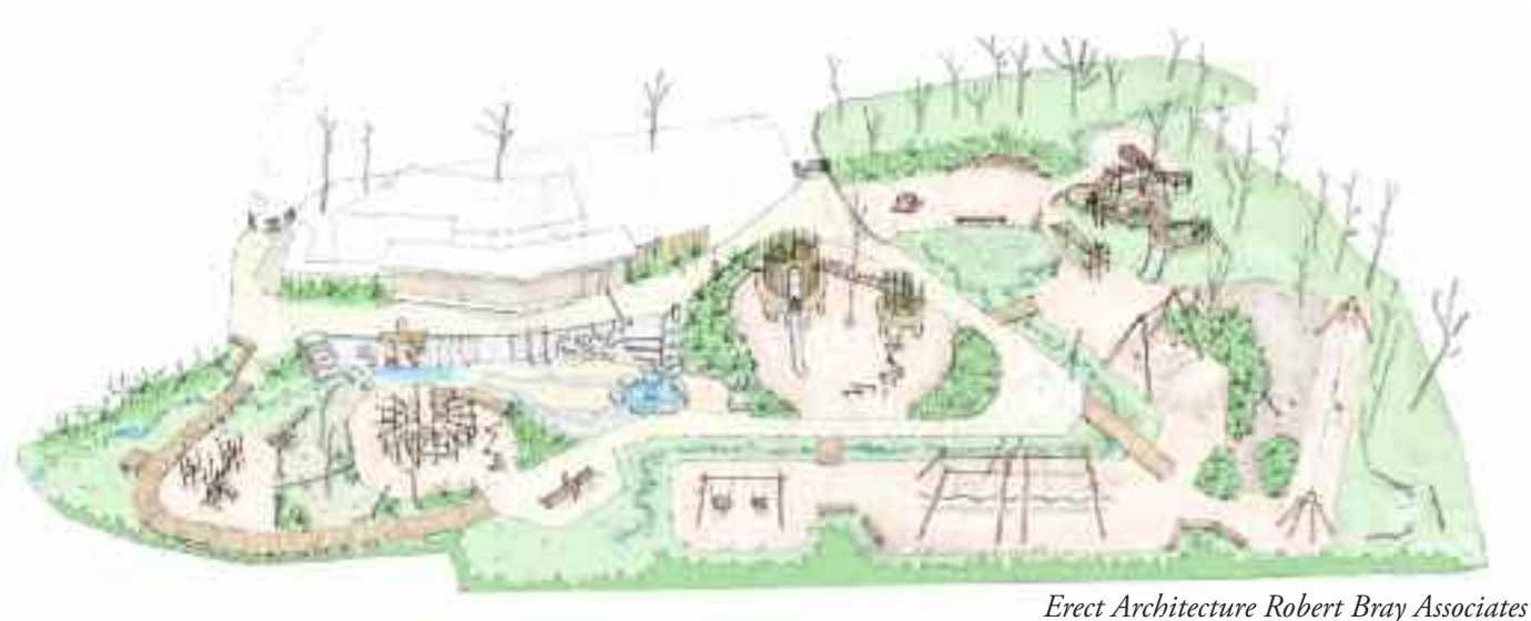
Proposed layout of Adventure Playground (not to scale)