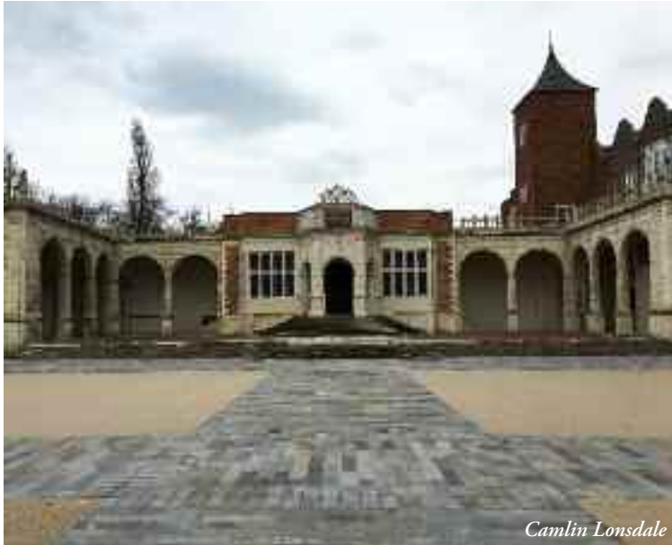
New House terrace

Thanks are due to Opera Holland Park for shaving time off the deconstruct time last autumn and a speedier